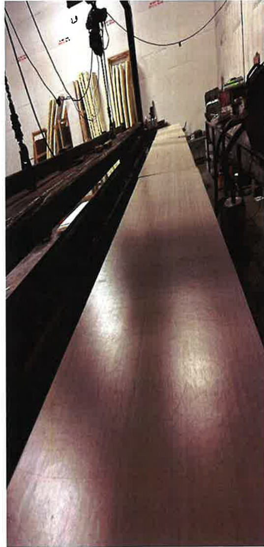
Photograph No. 1: Test specimen prior to testing showing the entire 24-foot test specimen from the fire exposure chamber's burner end (left), and vent end (right).

This report is the confidential property of the client addressed and may be reproduced only in full. Extracts from this report are not permitted without written approval from Right Testing Labs. Any liability attached thereto is limited to the fee charged for the individual project referenced. The results of this report pertain only to the specific sample(s) evaluated.