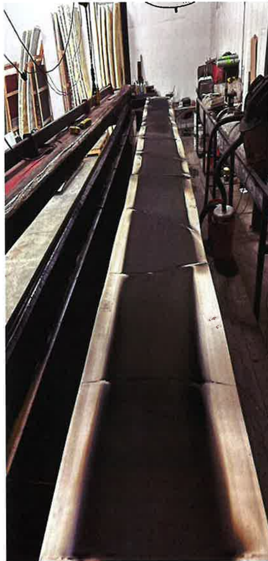
Photograph No. 2: Test specimen from the test chambers burner end (left), and vent end (right) showing the post 10-minute test sample condition immediately after removal from the test chamber.