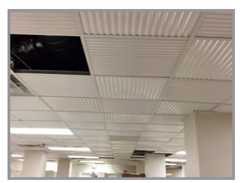
2' x 2' Lay-In tiles, perforated to increase sound absorption and offer acoustic qualities as well as all other 2' x 2' Lay-In tile features.