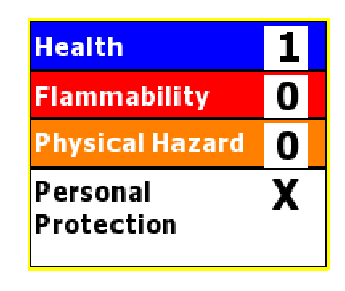
HMIS RATINGS (0-4)