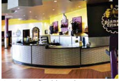
Panels are flexible and can contour but become rigid once installed.