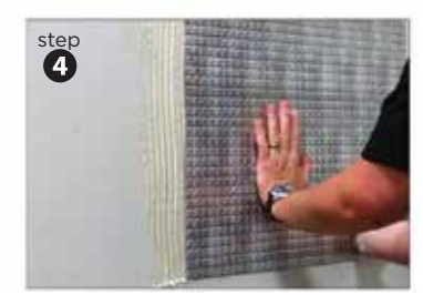
Apply pressure evenly on the different parts of the panel to ensure adhesion.