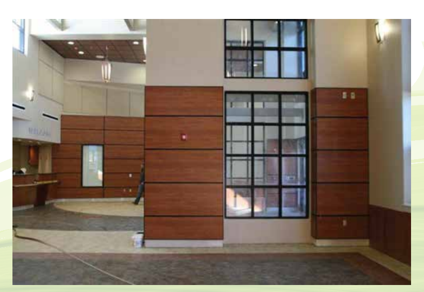
(above) HPL is a perfect choice for high traffic areas such as lobbies and waiting areas.

(left) Mix with other Marlite Wall Systems to create show stopping feature walls. This installation uses Sieva™ AND Myriad™ Wall Systems.