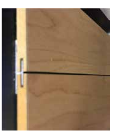
Pre-engineered reveals make installation a breeze.