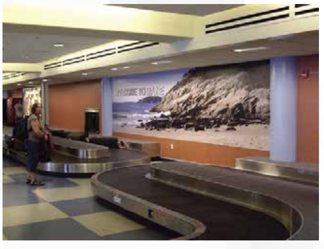
Digitally Printed Graphics and HPL Panels combine to create a durable, yet beautiful wall.