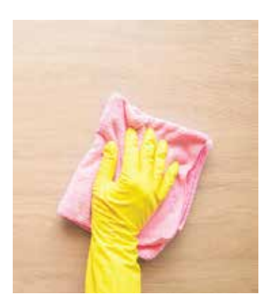
Make a clean sweep. The easy to clean HPL surface is a winner every time.