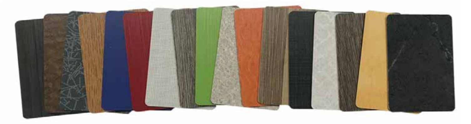
High Pressure Laminates are available in hundreds of finishes from the Industy's leading manufacturers.