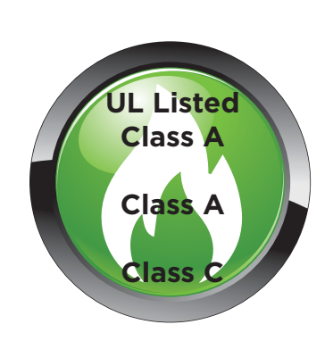
Remain cool. Sieva panels have earned

multiple fire ratings to meet even the toughest requirements for public spaces.