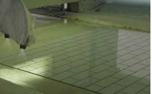
Sani-coat spray applied topcoat Seven low temp curing zones