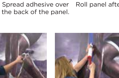
Tape and Apply Silicone