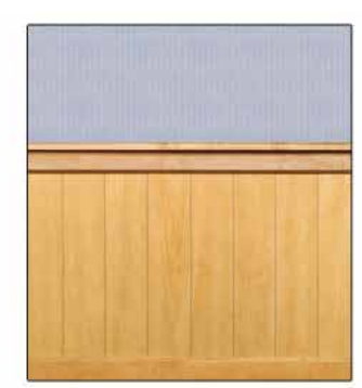
Easy to install and eliminates job site finishina.