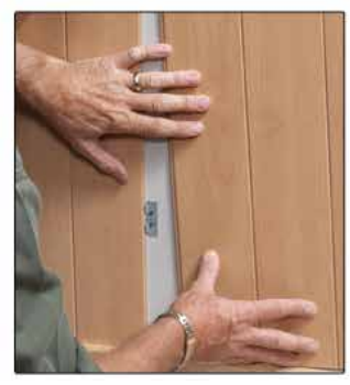
16" wide panels are easy to handle.