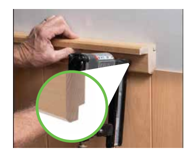
Moldings are easy to apply