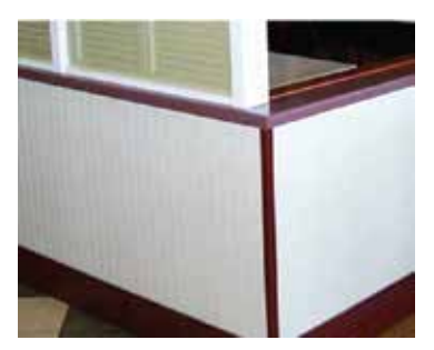
Great color control No jobsite sanding, staining, or painting required.