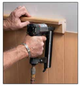
Wood molding includes chamfered rabbet profiles.