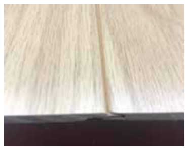
Almost Seamless Design* and requires no visual fasteners*