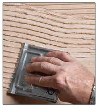
Apply adhesive to the panel back and adhere to the subwall.