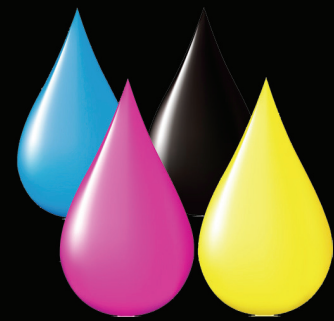
VOC-free UV cured inks

That's how long our BlueSky™ Advanced Finishing Line is – over two football fields. State-of-the-art sanders, spray booths, digital printer and curing ovens create a finish unmatched in the wall panel industry.